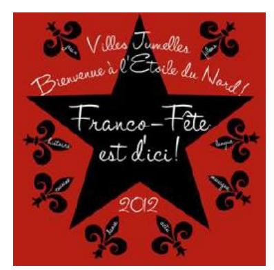
2012 Franco Fete Logo