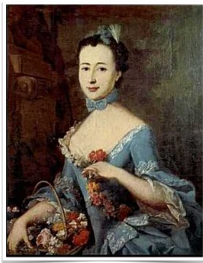
Portrait of Frederika Charlotte Louise von Massow, Baroness Riedesel, 1829 Johann Heinrich Wilhelm Tischbein (1751-1829) Oil on Canvas

Then I wondered, when and where was the first decorated Christmas tree in North America? To my surprise, I found out that the first one was put up on December 24, 1781, in the town of Saurel (now known as Sorel-Tracy) in the Province of Quebec. It was the Baroness Frederika Charlotte Louise von Massow Riedesel, wife of the Baron Friedrich Adolph Riedesel, who decorated a fir tree with fruits and candles in honor of the German officers that came over to their house. The Riedesel family was also celebrating their freedom. A few months before, they had been incarcerated by the Americans who had just gained their independence from the British Crown.