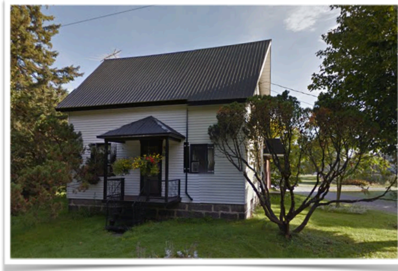
Brodeur Homestead - Ste-Hélène-de-Bagot, QC