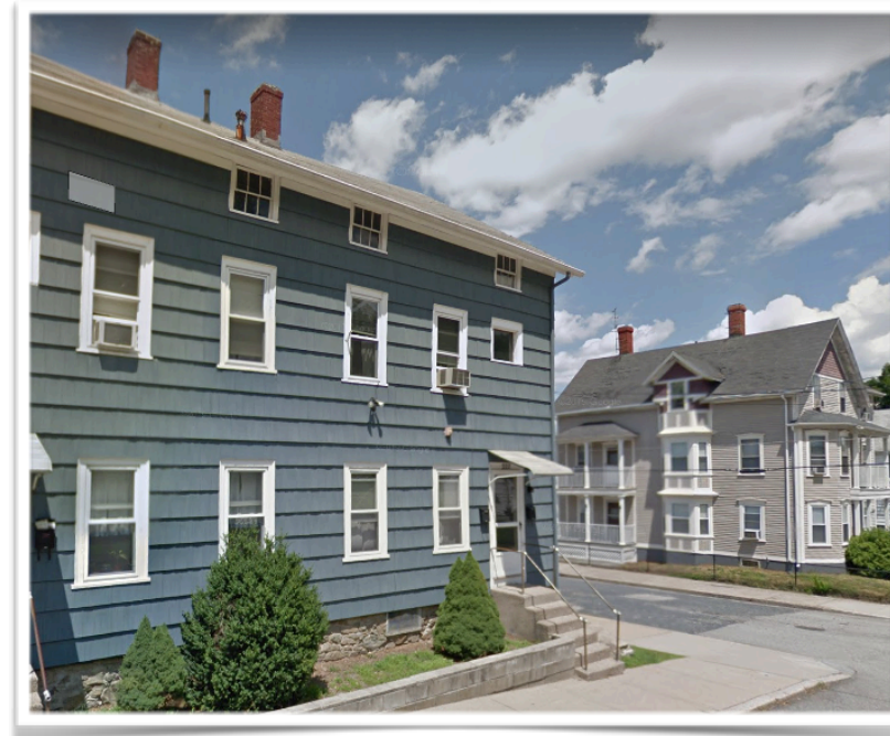
222 & 244 Paradis Avenue, Woonsocket, RI