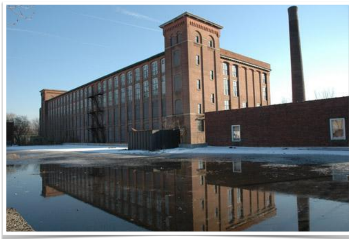
Desurmont Mill, Woonsocket, RI