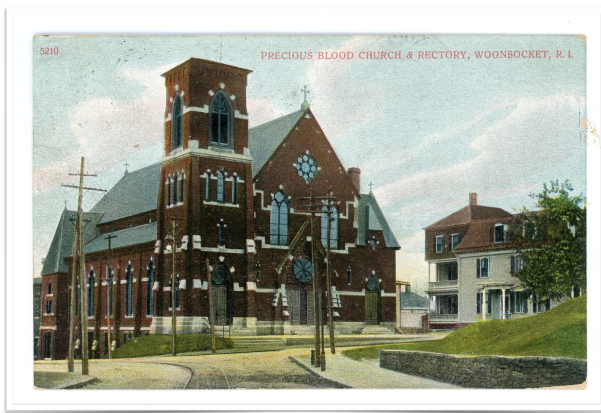
Precious Blood Church & Rectory, Woonsocket, RI