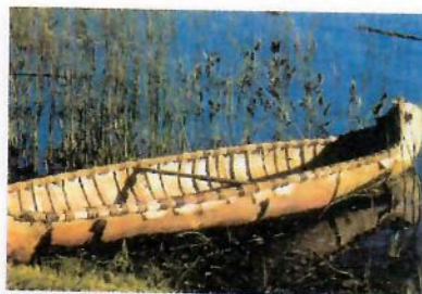
Birch bark canoe 27

He was a remarkable man who lived life to its fullest and was a “man for all seasons.”