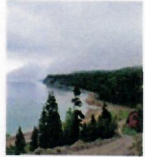
Anticosti Island 22

Louis never lacked for optimism or ambition. 21 He was always thinking ahead of the possibilities that might be available to him.