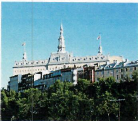
The Old Seminary in Québec 9