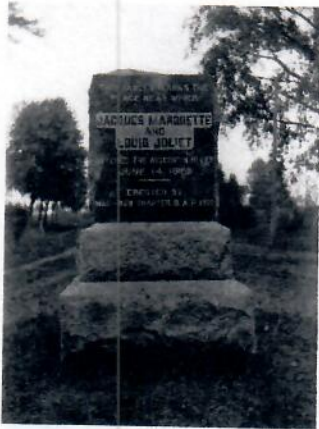
Marker at Portage 15

In the middle of May of 1673, the expedition left the Mission. There were seven men, including Joliet and Marquette, in two canoes. Imagine their excitement when they thought of entering territory no European had ever seen before. From Mackinac, the party traveled to Green Bay (Baie des Paunts). Then they entered the Fox River (Rivière aux Renards). They spent some time at the little mission of Saint François Xavier near what is now DePere, Wisconsin. Then they followed the Fox until it was too shallow for canoeing. They heard from the Indians that with a portage of less than 2 miles they would find a tributary of the Mississippi. And they did portage to the Wisconsin (Rivière Meskousing) at what is now Portage, Wisconsin.