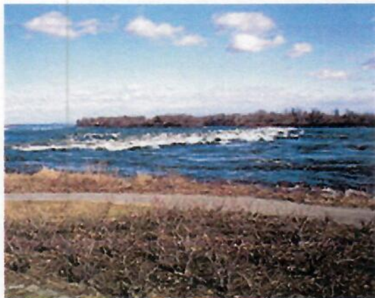
Lachine Rapids at Montréal 17

They turned their canoes around and headed north. This time, they took a different route back. They ascended the Illinois River on August 25, made a portage at Chicago, and entered Lake Michigan. Then they went to Green Bay and back to the Saint-François Xavier Mission, which they reached in mid-October. Louis continued on to Sault Ste. Marie and spent the winter there with the Jesuits, copying his log-book and maps for safe keeping.