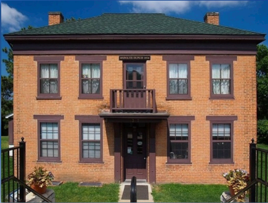
Dupuis House at Sibley Historic Site in Mendota